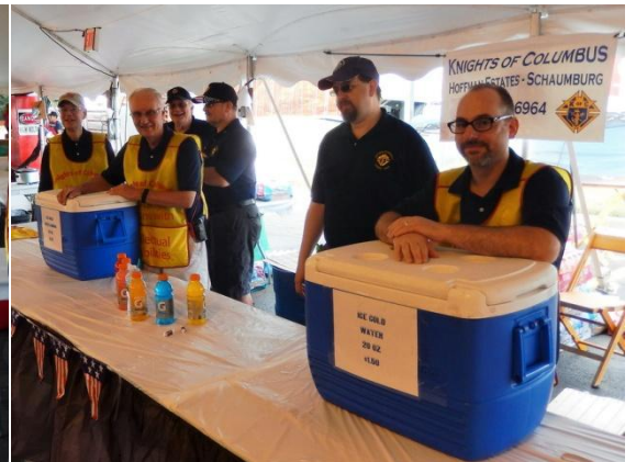
The Knights in Force ready for the crowds