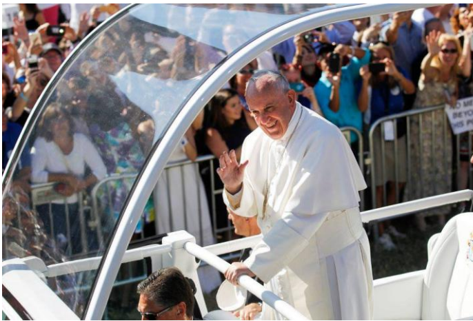
Pope Francis arrives for Mass and the canonization of Junipero Serra at the Basilica of the National Shrine of the Immaculate Conception in Washington Sept. 23rd.