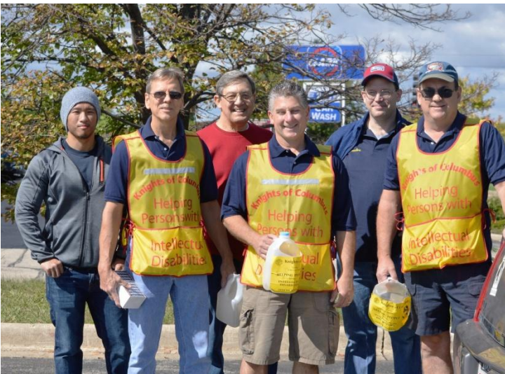
Front row Back Row