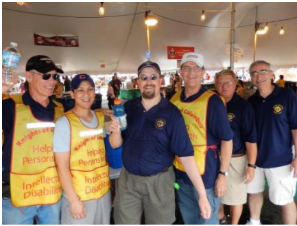
Ready to sell