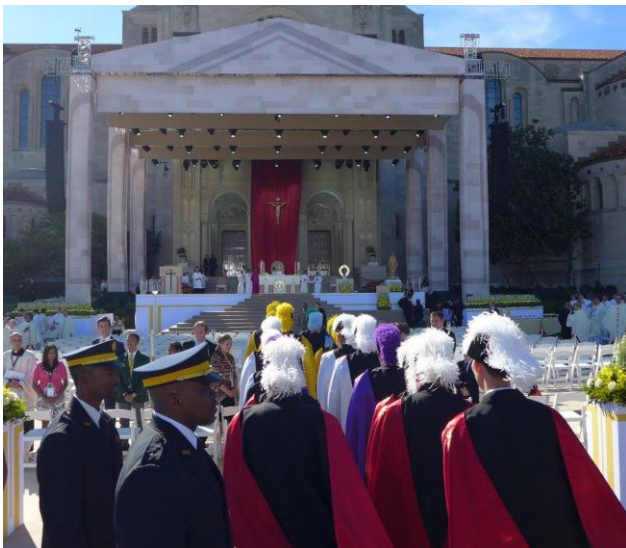
A fourth Degree Honor Guard leads the opening procession for the Mass of Canonization of St. Junipero Sera