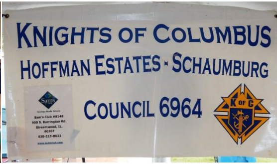
Our sign at the Booth